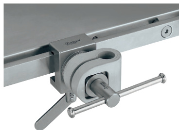
RT090R - OR Table Clamp