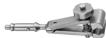
RT072R - Universal Instrument Holder