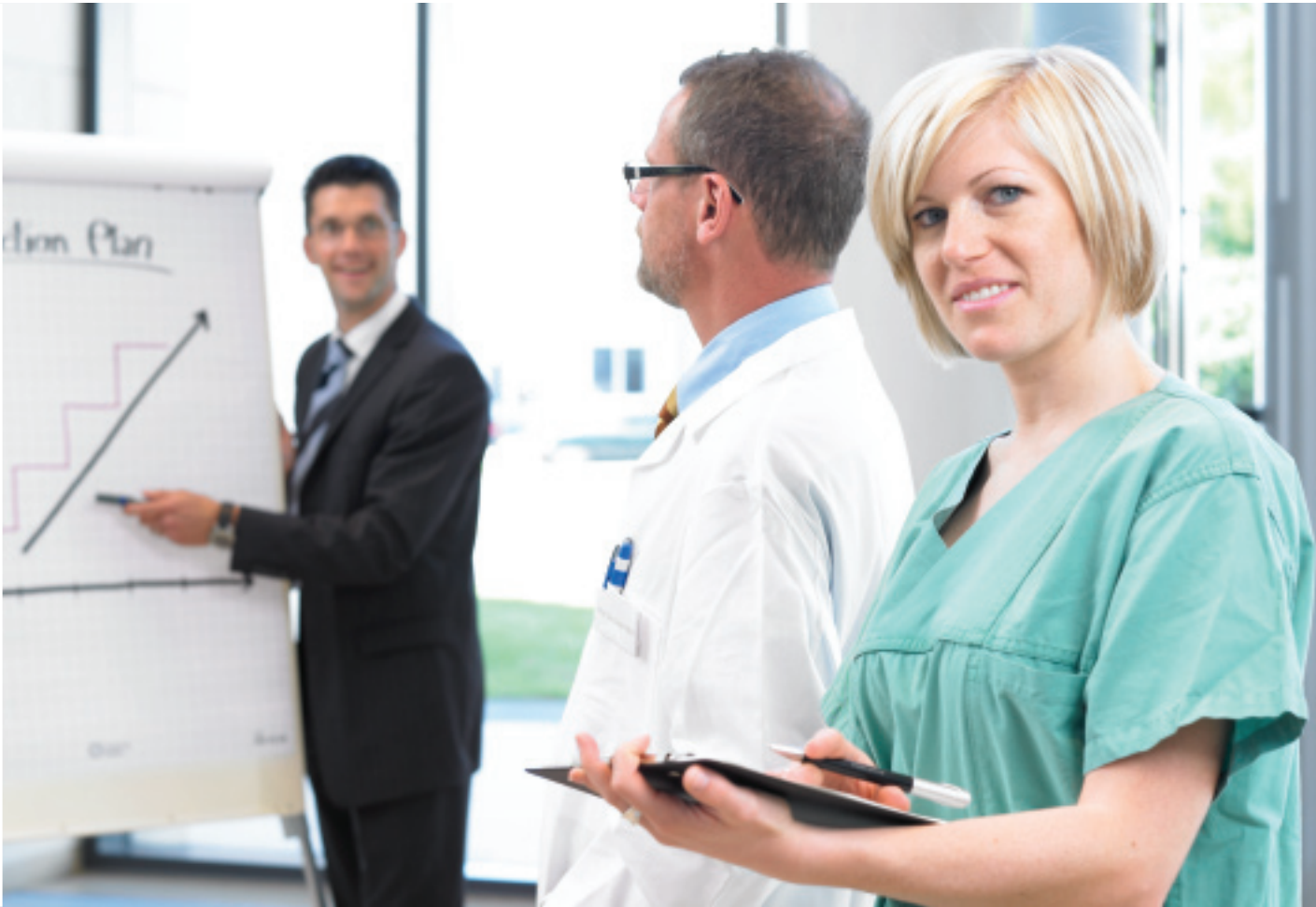
Aesculap Service Systems